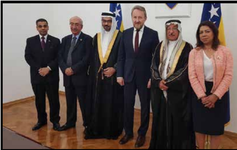
The business delegation of the Bahrain Chamber of Commerce and Industry (BCCI) headed by chairperson of the Bahraini side of the Bahrain-Bosnia Joint Business Council Ahmed Al Saloom met the Muslim Bosniak leader Bakir Iztetbegovic on the sideline of their participation in the 8th Sarajevo Business Forum 2017 held in the capital city of Bosnia and Herzegovina. During the meeting, the Bosnian leader commended the Bahraini business delegation on its participation in the business event