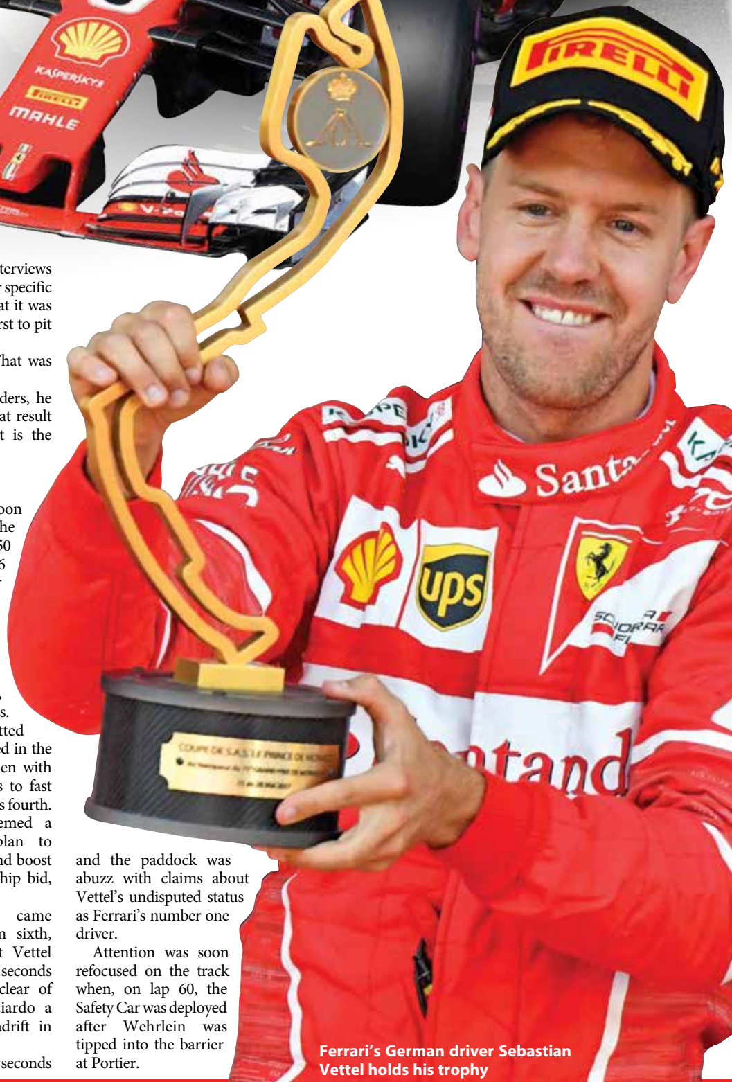
Ferrari's German driver Sebastian Vettel holds his trophy