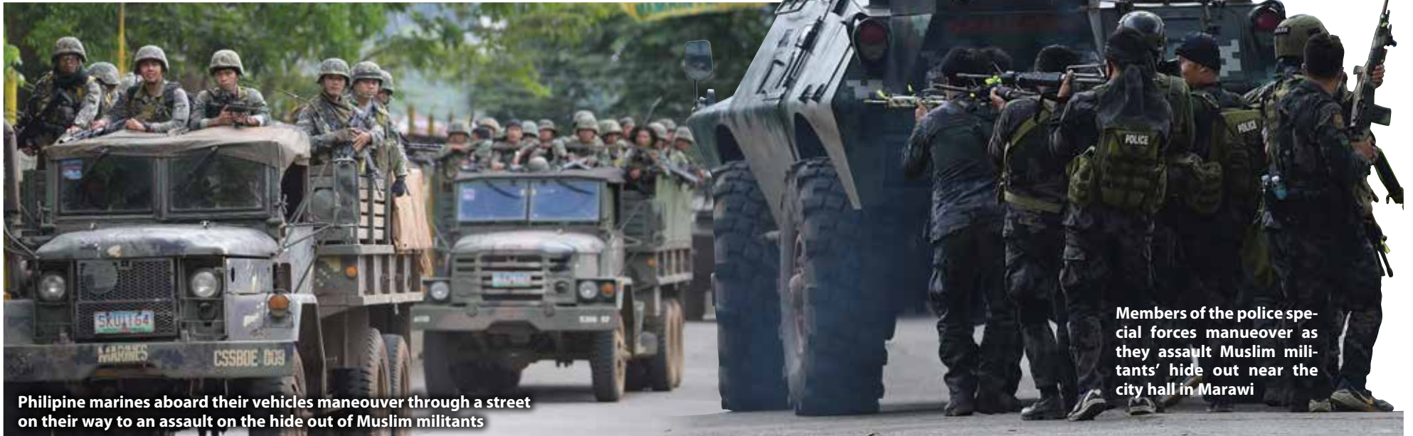
Philippine marines aboard their vehicles maneuver through a street on their way to an assault on the hide out of Muslim militants