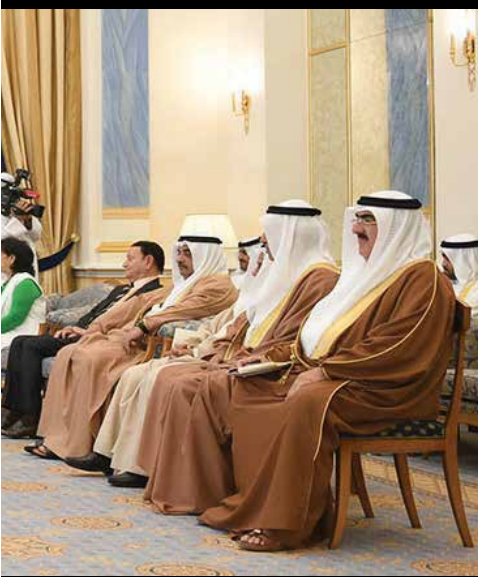
Prime Minister HRH Prince Salman Al Khalifa yesterday received senior state officials, as well as trade, economic, intellectual and press personalities at the Gudaibiya Palace. Discussions focused on the importance of expanding Bahrain's external investments by developing private sector partnerships. HRH the Premier affirmed the kingdom's full support to all effort aimed at speeding up the pace of development