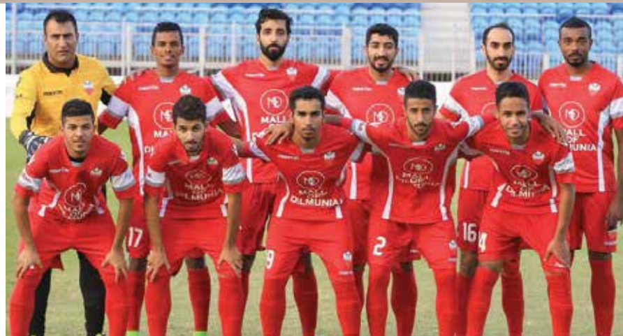
Suqoor Al Bahrain eye another victory

Meanwhile, HH Shaikh Nasser bin Hamad Al Khalifa, Representative of His Majesty the King for Charity Works and Youth Affairs, Chairman of the Supreme Council for Youth and Sports, President of Bahrain Olympic Committee (BOC), directed for the support of T.V programme "Al Bank" with prizes from the Third Nasser bin Hamad Sports Games "Nasser 10". The programme is being aired on Bahrain TV channel during the holy month of Ramadan. Shaikh Nasser's initiative