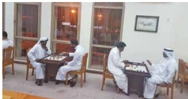
From the qualifiers of the Checkers championship

comes as part of his vision to expand it into a comprehensive national project and not just focussing on the sports field,