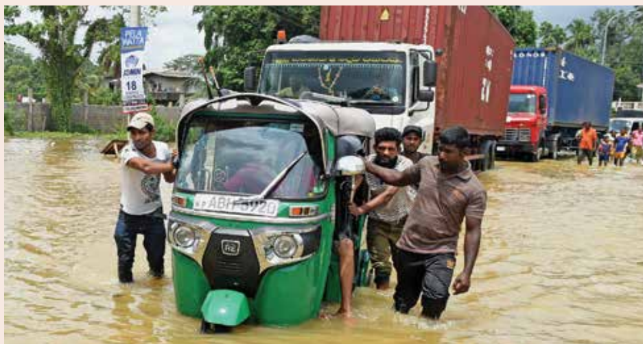
Sri Lankan residents making their way through floodwaters in Kaduwela

Water levels in Ratnapura, Sri Lanka's gem district east of Colombo, had subsided