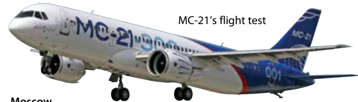
MC-21's flight test