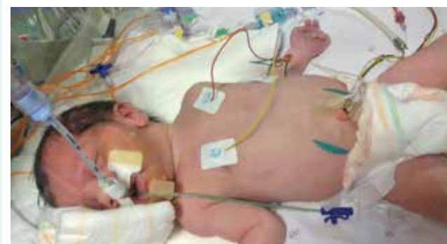
The newborn baby at Salmaniya Medical Complex ICU