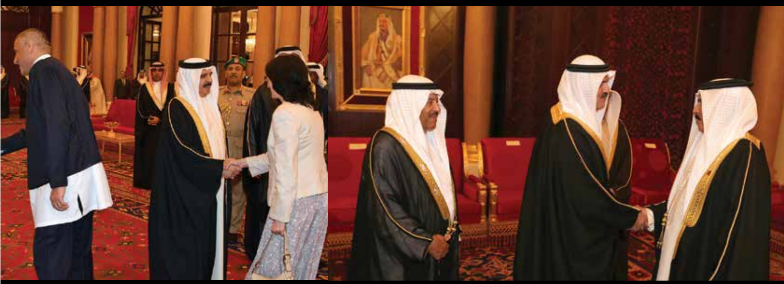
His Majesty King Hamad bin Isa Al Khalifa yesterday received at Al Sakhir Palace, in the presence of His Royal Highness Prime Minister Prince Khalifa bin Salman Al Khalifa and His Royal Highness Prince Salman bin Hamad Al Khalifa, Crown Prince, Deputy Supreme Commander and First Deputy Premier – the Council of Representatives Speaker, Shura Council Chairman, ministers, Supreme Judicial Council Acting President, National Audit Office Chief, Bahrain Chamber of Commerce and Industry Chairman, governors and municipal councils chairmen. HM the King also received heads of diplomatic missions, who congratulated him on the advent of the month of fasting. HM the King appreciated the dedicated efforts of ambassadors to expand cooperation between Bahrain and their respective countries