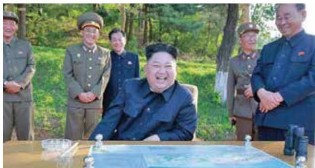
North Korean leader Kim Jong Un inspects a missile test site KCNA said.

Pyongyang first tested the new weapon system in April, but Kim said the latest test verified that all glitches had been "perfectly overcome",