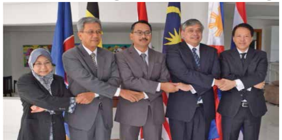
Members of ACMB during inaugural meeting

At present, five ASEAN Member-states have diplomatic missions in Bahrain, consisting of Brunei Darussalam, Indonesia, Malaysia, Philippines and Thailand. Singapore has a non-resident Ambassador accredited to the Kingdom of Bahrain but is based in Saudi Arabia. The meeting discussed the