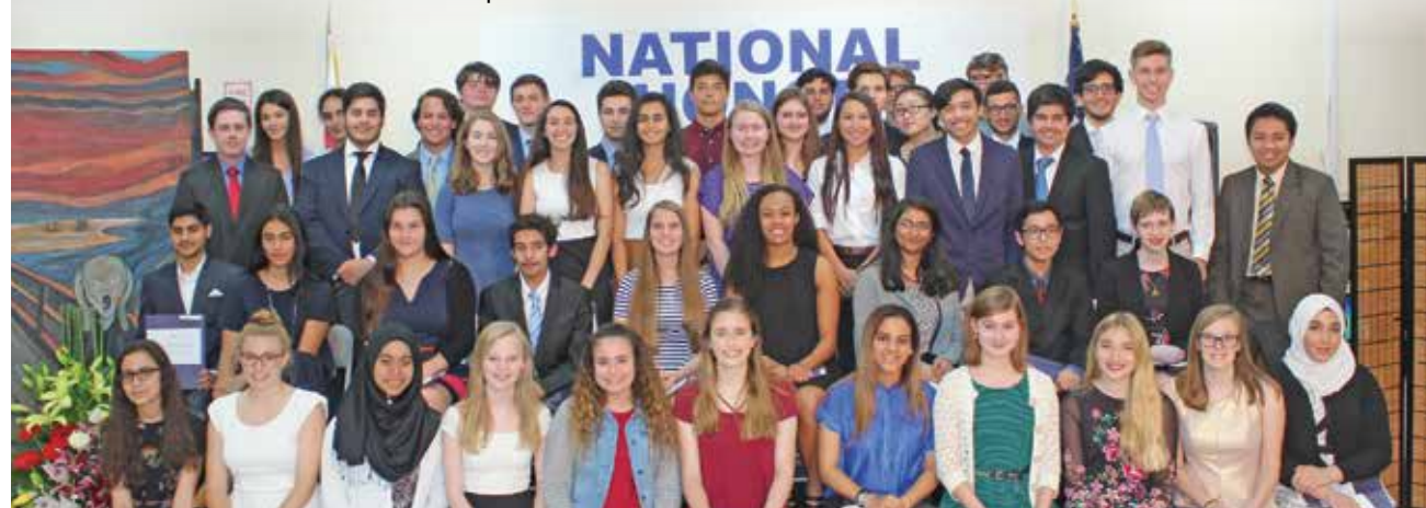
The new members during a photocall

Bahrain School (BS) held a ceremony to induct 27 new members into the Dilmun Chapter of the National Honour Society. Welcoming the new members, the current NHS president spoke on the importance of character development and held a traditional candle lighting ceremony. The event ended with a small reception in honour of the new inductees and their families. Parents, students and teachers of Bahrain School were present.